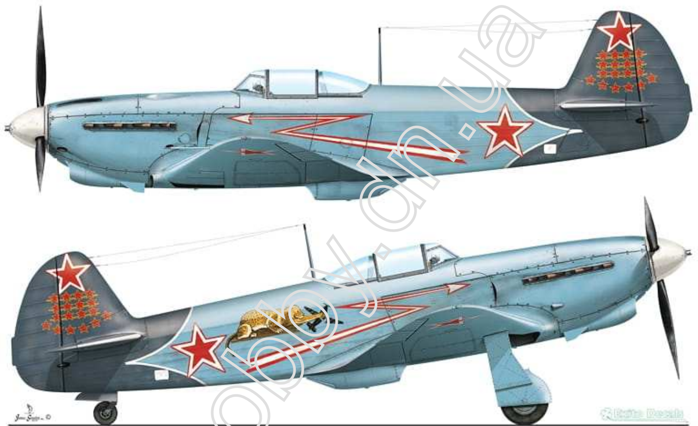
Yakovlev Yak-1b, flown by Capt Vladimir P. Pokrovskiy of 2nd GIAP / 6th IAD, Air Force of the Northern Fleet, probably late 1943.