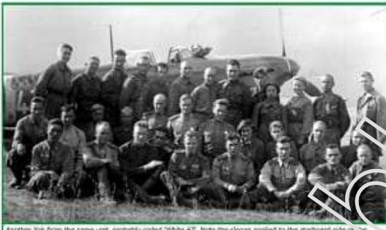
Another Yak from the same unit, probably codes "White 47", lists the slogan applied to the starboard side of the fuselage and the distinctive propeller spinner finish.