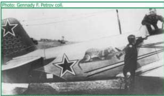
The victory markings on the tail represent the total score of this pilot, i.e. 12 personal and 6 shared victories. Capt. Pokrovsky was awarded the title of Hero of the Soviet Union on July 24th, 1943.

Our interpretation of this aircraft's finish as AMT-7 Light Blue overall with the tail painted in AMT-12 Dark Grey, results from the comparison of AMT-7 and AMT-12 appearance on various photos and the lack of visible colour demarcation on the lower surfaces of the fuselage sides.