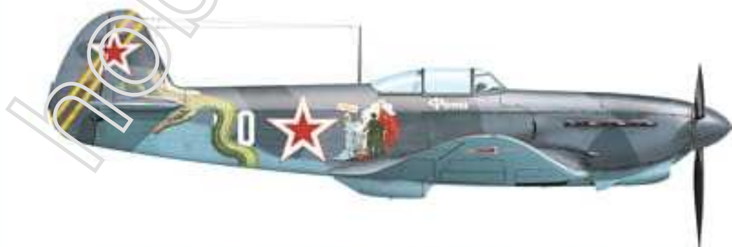
Yakovlev Yak-1b, most likely coded 'White 20', flown by Snr. Lt. Fotiy Y. Morozov of 31st GIAP / 6th GIAD, 4th Ukrainian Front, first half of 1944.