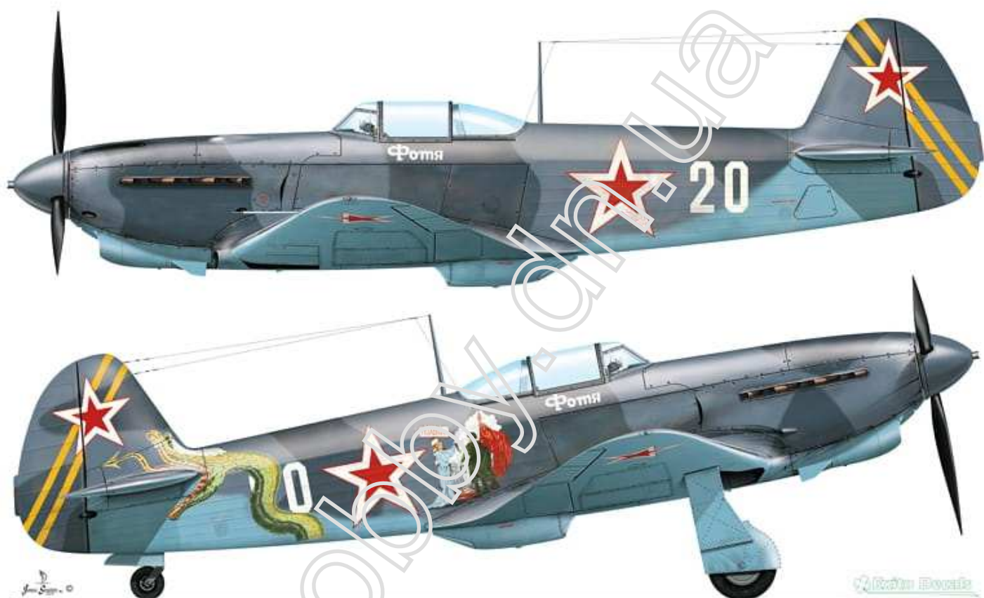
Yakovlev Yak-1b, most likely code 'White 20', flown by Snr. Lt. Fotiy Y. Morozov of 31st GIAP / 6th GIAD, 4th Ukrainian Front, first half of 1944.